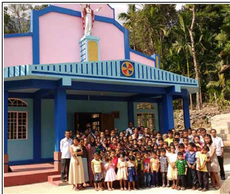
THIS PAGE: PHOTOS OF PAST CHAPEL PROJECTS; OPPOSITE: THE NEWLY CONSTRUCTED ST. MARY'S PARISH CHAPEL